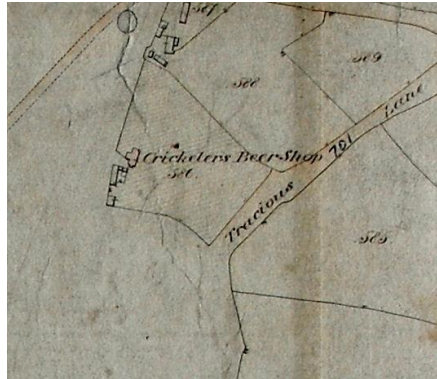
Extract from Edward Ryde's 1851 map (11). 586 is the Cricketers and 587-9 Birch Farm House

usual cottages found on the edge of commons. Presumably the inhabitants would have originally used the common to graze their livestock. With the end of such practices this grazing would have been taken over by invasive birch. Here we are concerned with Horsell Birch which probably owes its name to the tree.