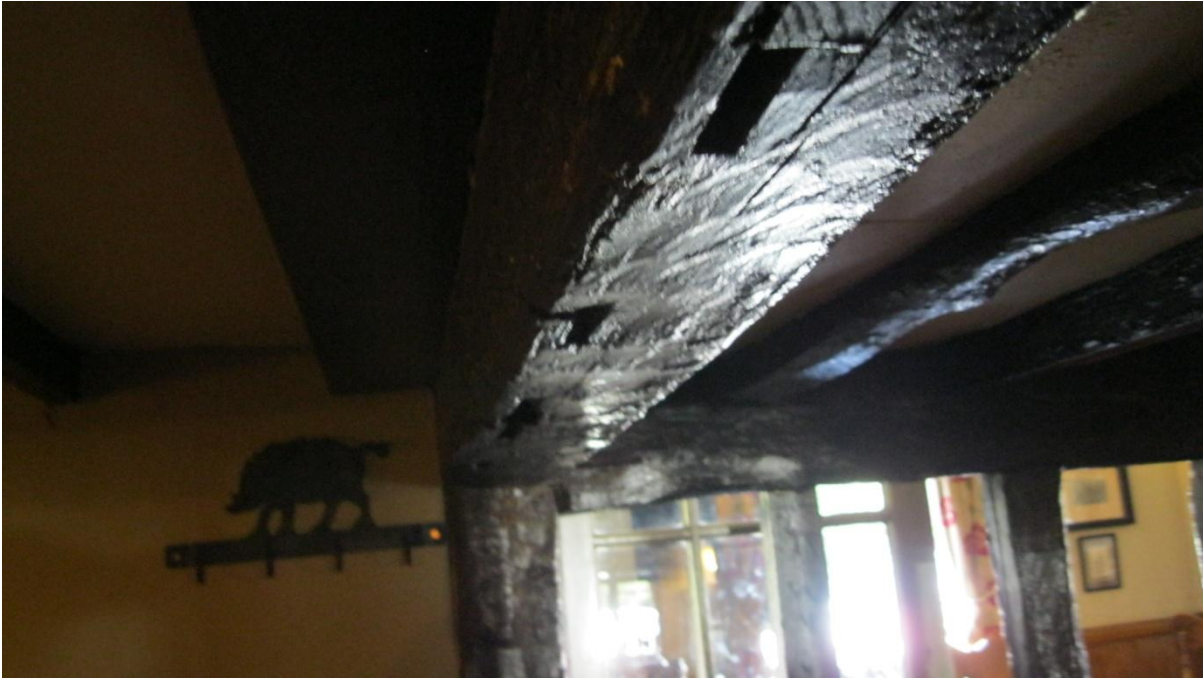
6. Slots for removed partitioning