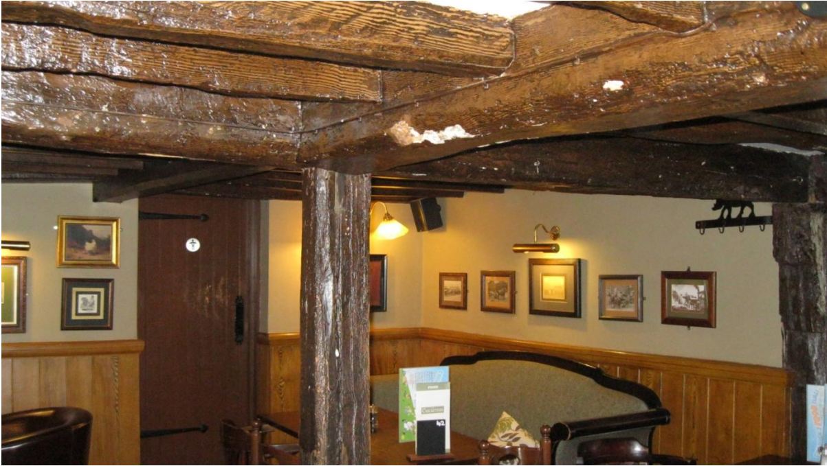
5. Inside the cottage with the partitioning removed and replaced by an imported post