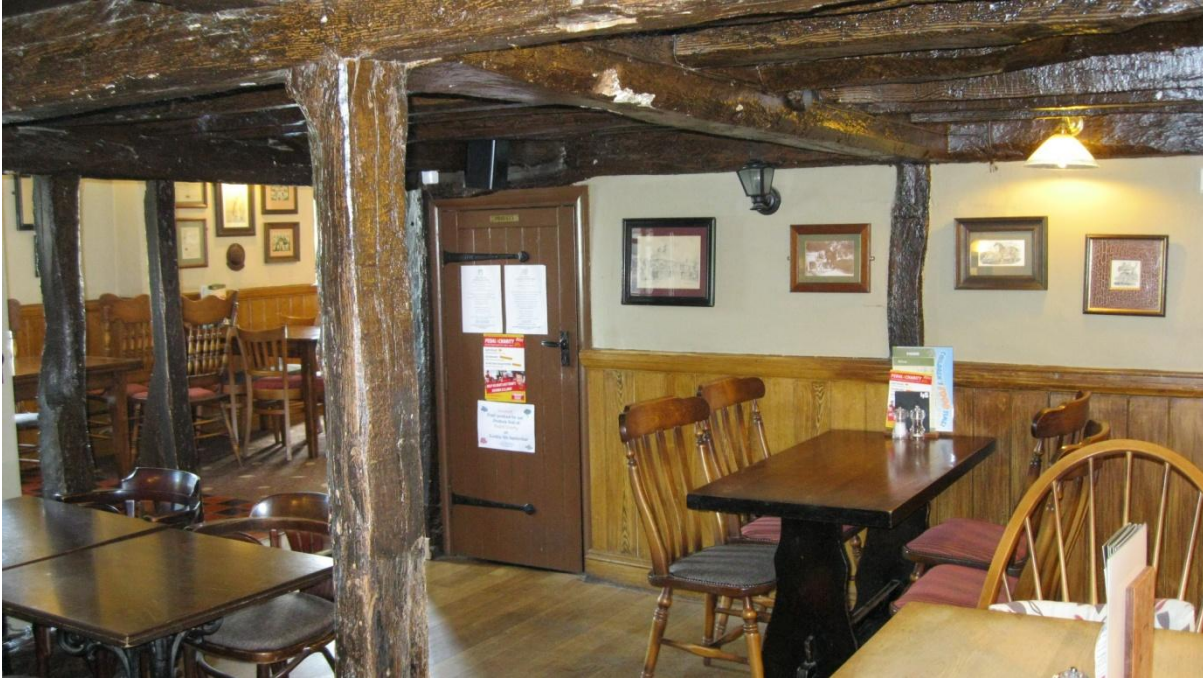
7. Inside view of original cottage north wall