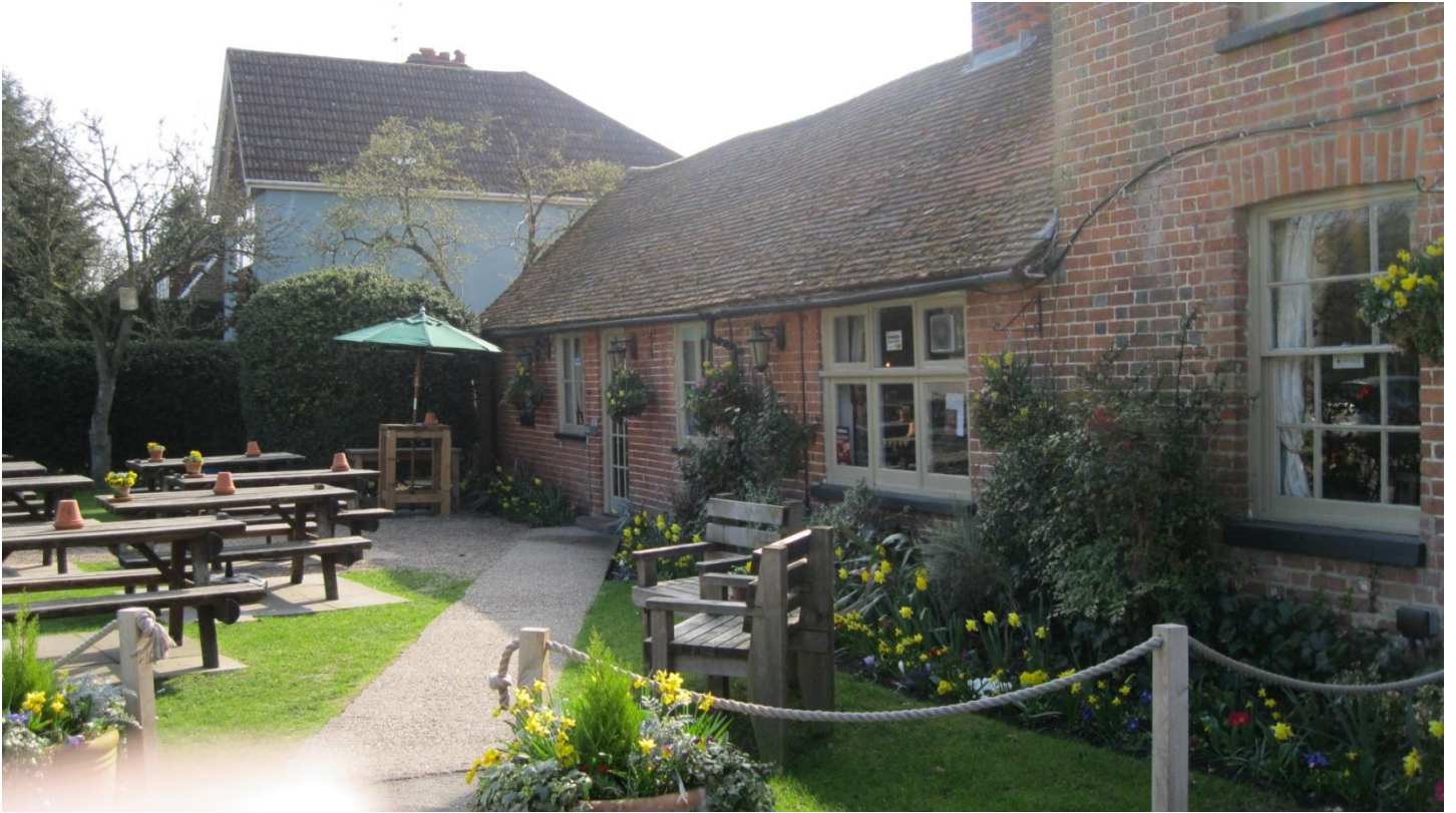
15. Single storey extension on the west side