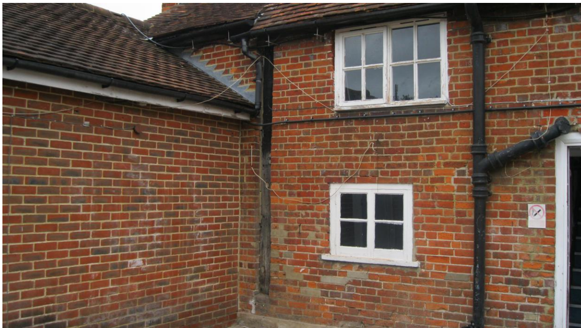
13. Corner post of the original cottage temporarily revealed at the rear