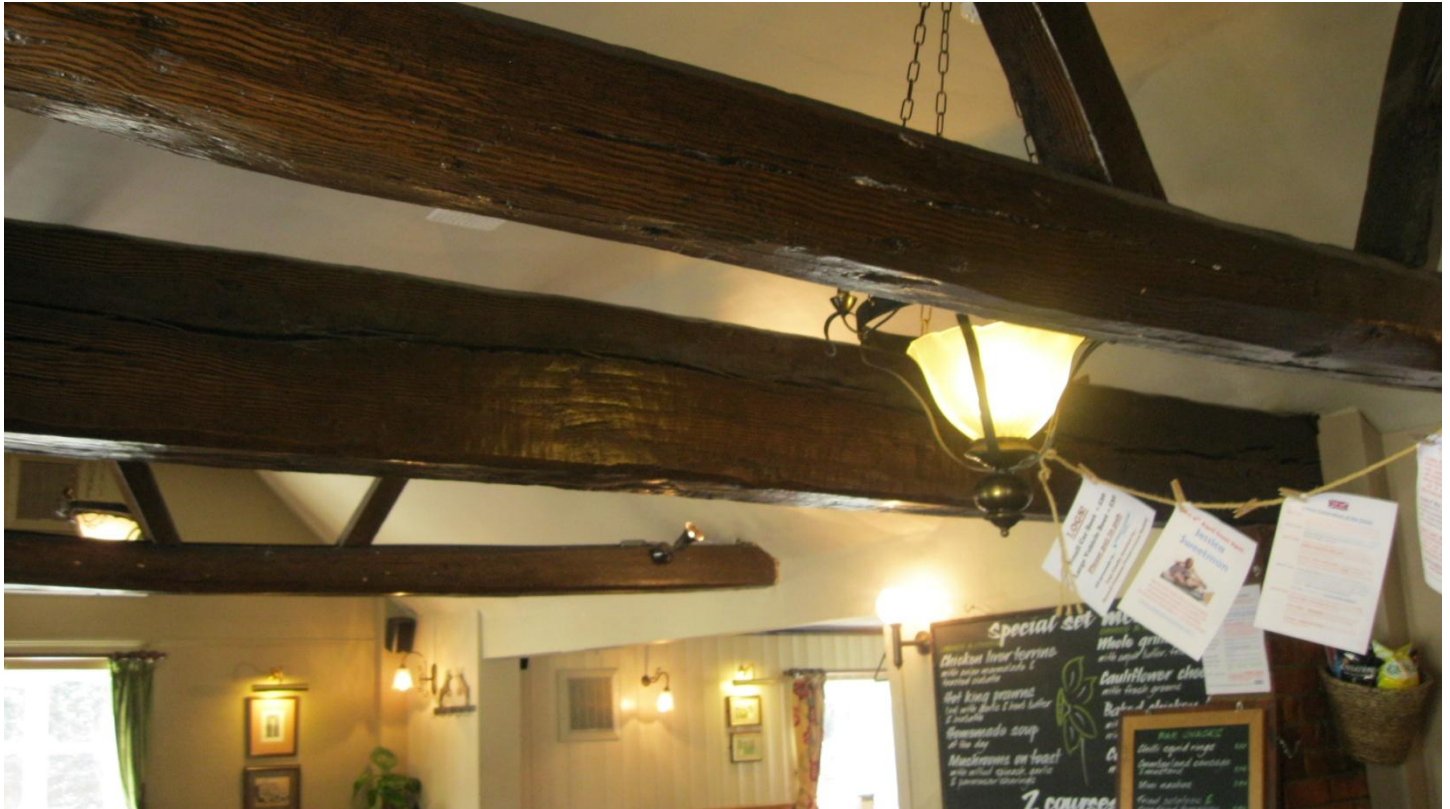
16. Inside of extension showing three beams.