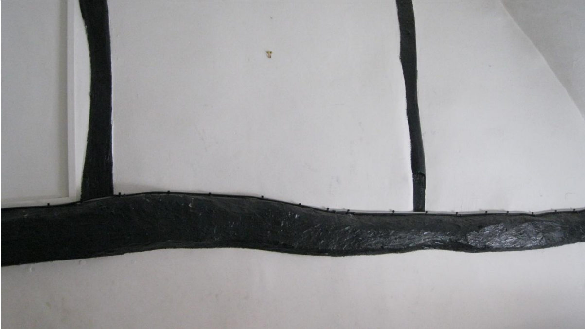
11. Inside of stair wall, possibly east end of original cottage.