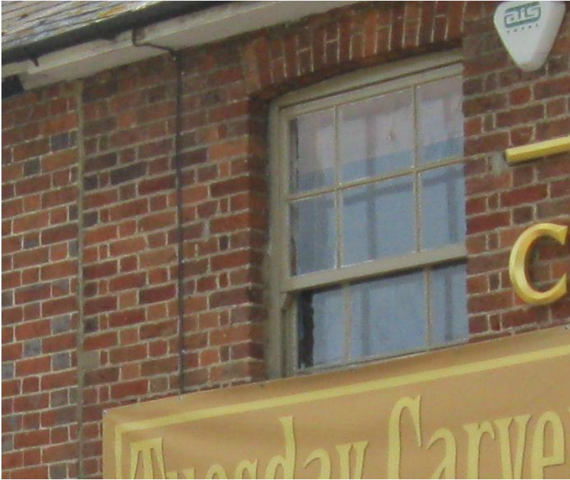
14. Brickwork at front showing extension to the east