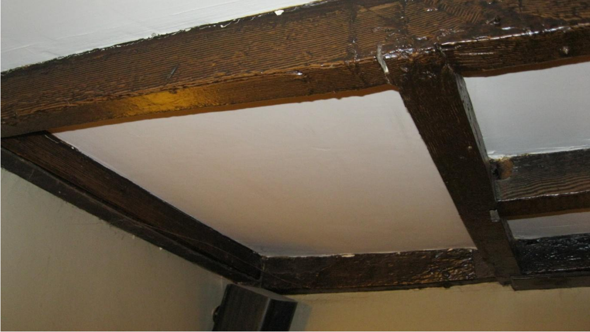
10. Possible stair space in bar.