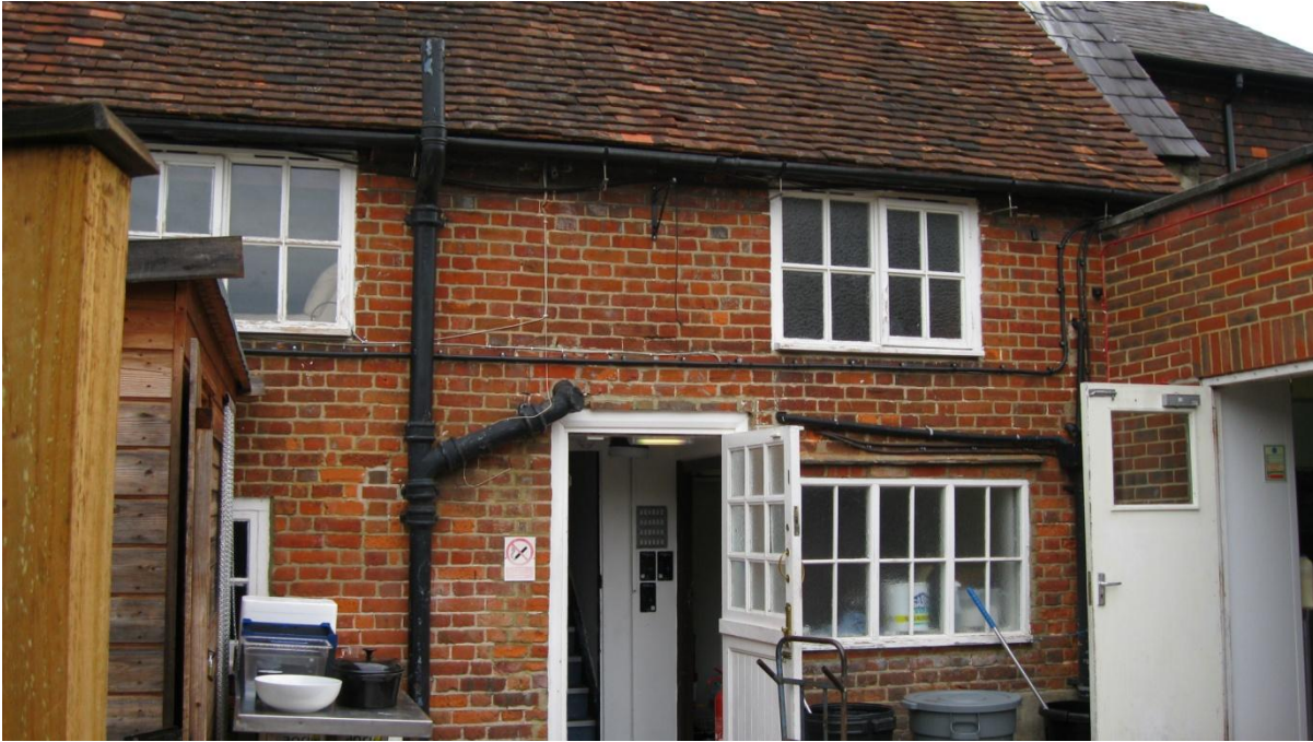
2. Rear elevation of the Cricketers showing the brick encased old cottage