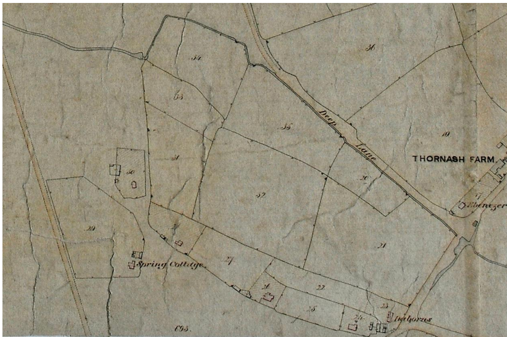
Another extract from Edward Ryde's map (8). Birch Cottage is 23, Birch House 24, Elm Cottage/Ivy Cottage 26 and Spring Cottage 29. The Hampton/Daborn families lived at 28 and the Elson family at 30.