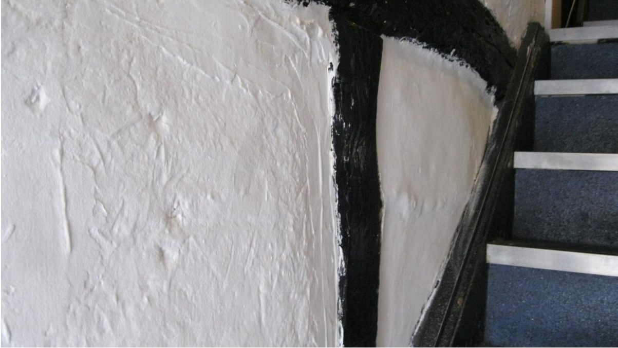
12. Outside of stair wall