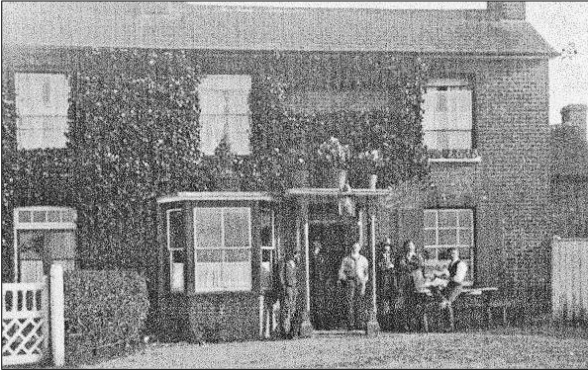
3. Old print showing position of original front door