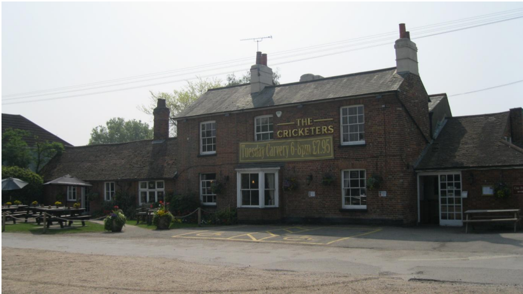
1. Front elevation of the Cricketers