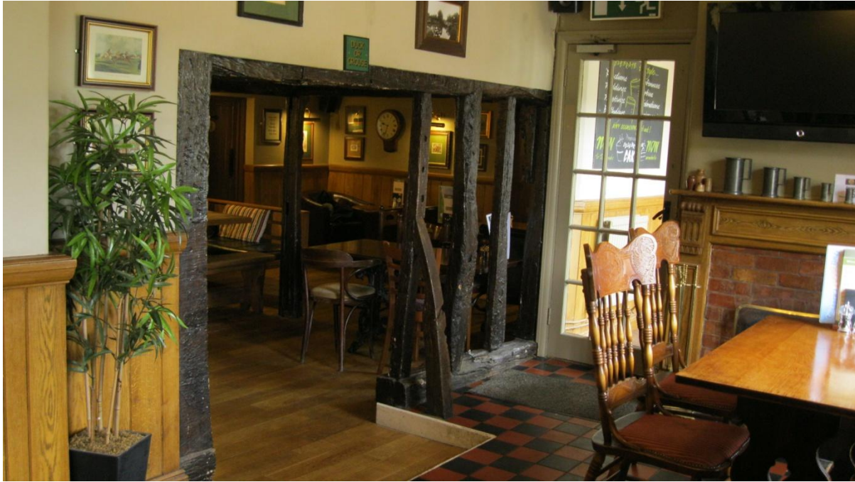
4. North side of the old cottage showing the original front wall