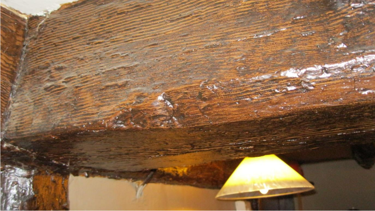
8. Lambs tongue stop