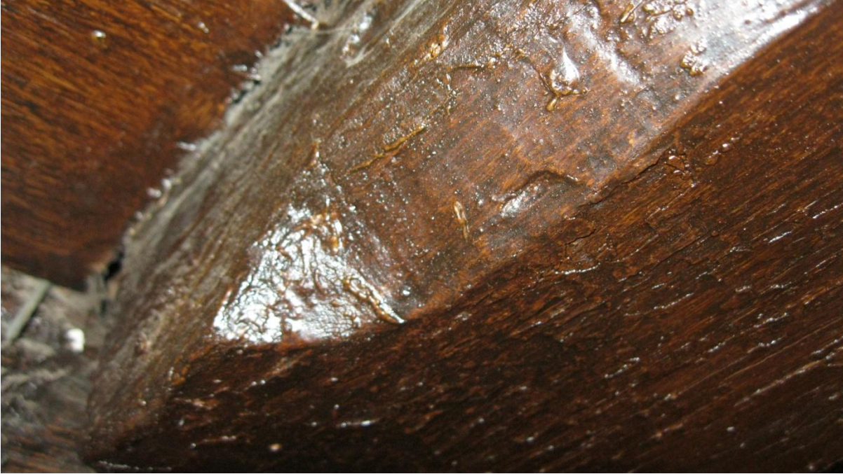
9. Curved stop in bar