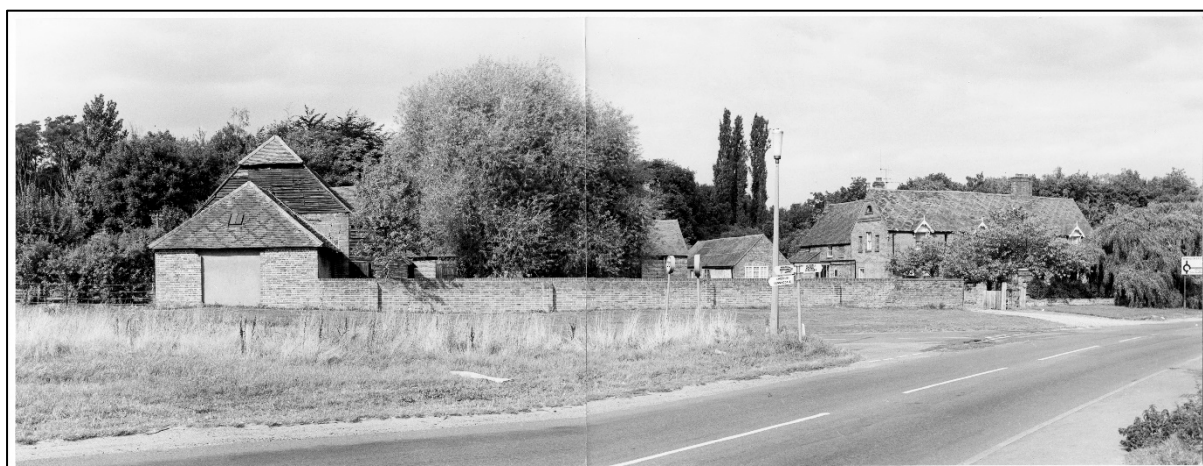
South end of barn with house to the right 1978