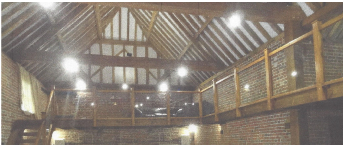
North gallery in May 2017

Inside other work done has been a completely new floor with foundations, insulation and a concrete screed with slabs on top. In addition, galleries have been erected at both ends.