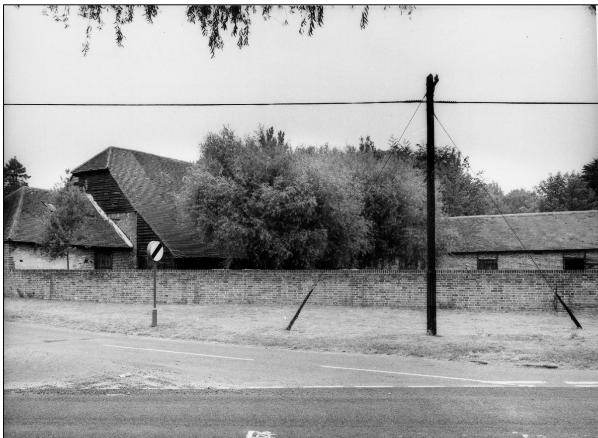
South end of barn showing weatherboarding 1972