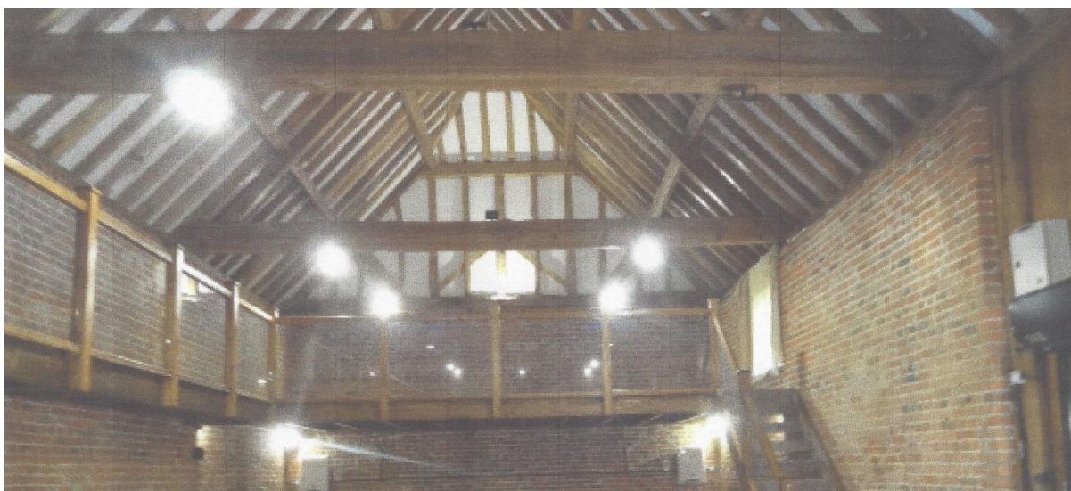
South gallery in May 2017

Both internal brickwork and any woodwork with problems have been repaired. New doors have been put in where necessary.