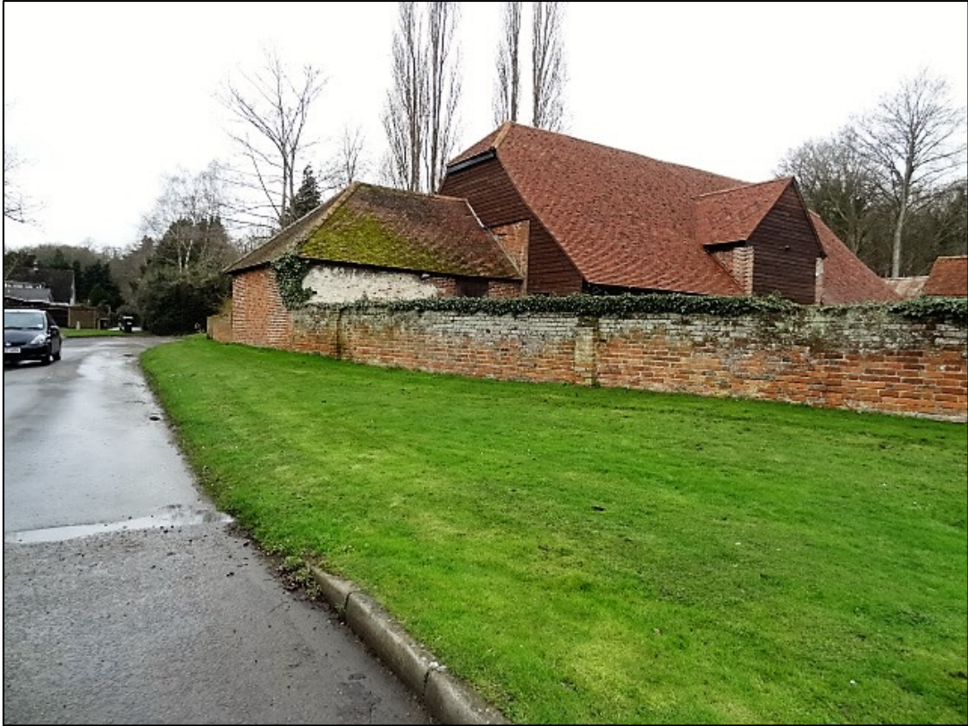
Note above weather boarding on south front gable