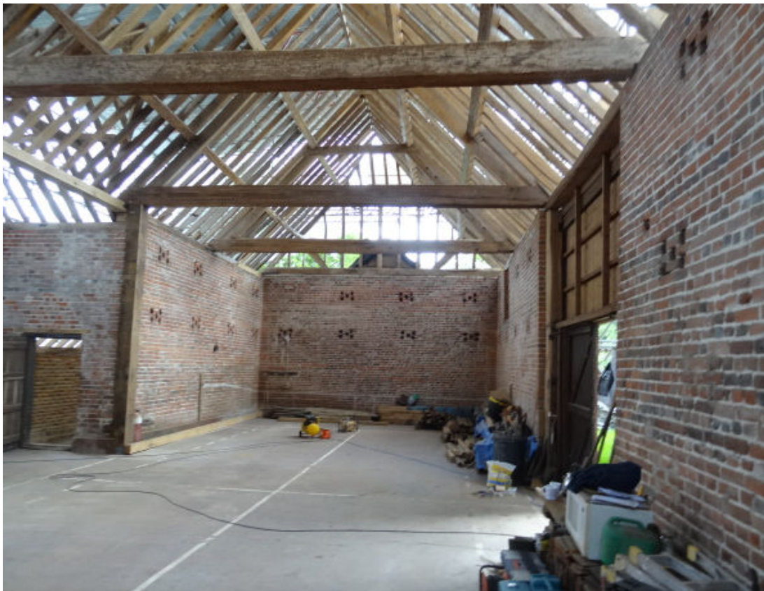
This picture taken in June 2016 shows the inside framing including one of the strengthening oak posts.